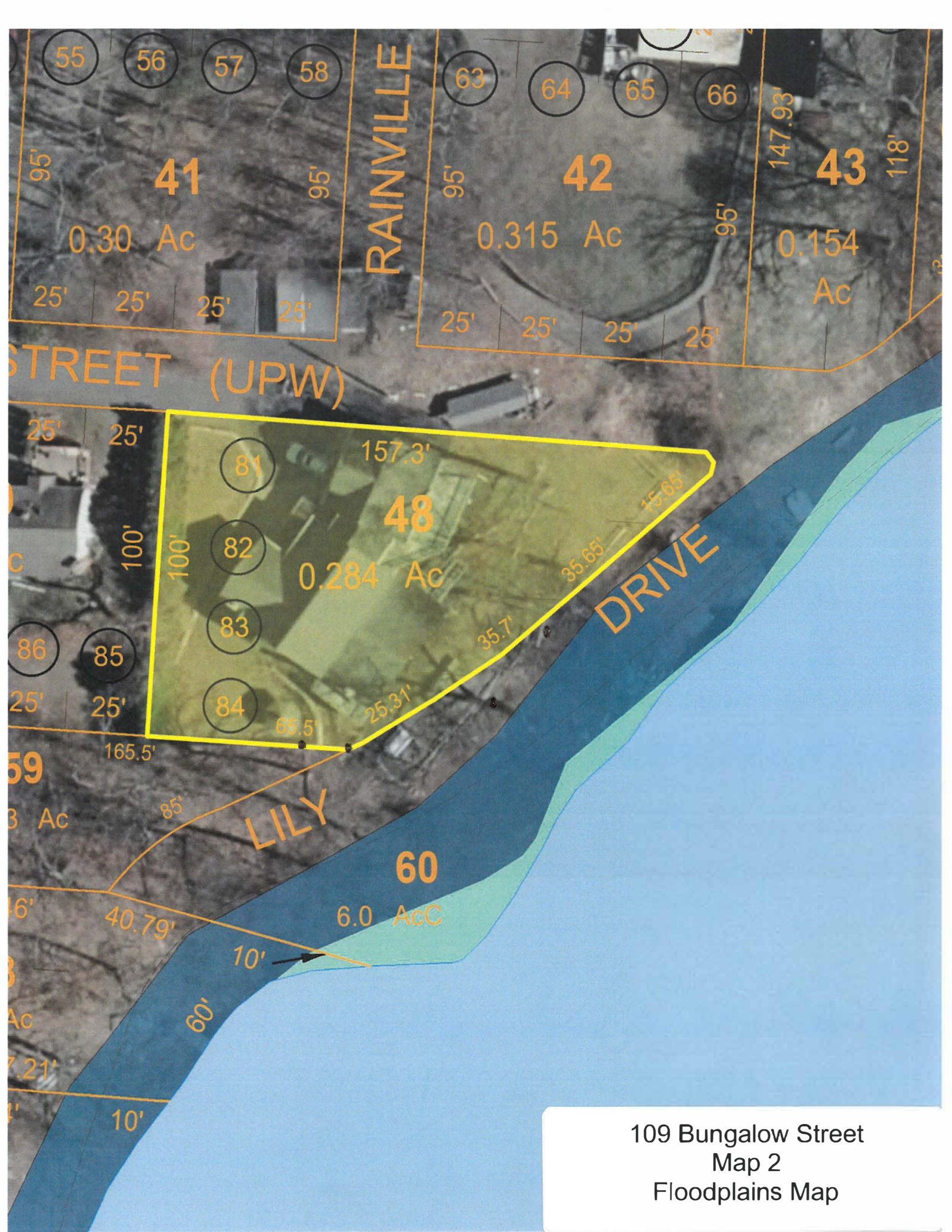
109 Bungalow Street Map 2 Floodplains Map