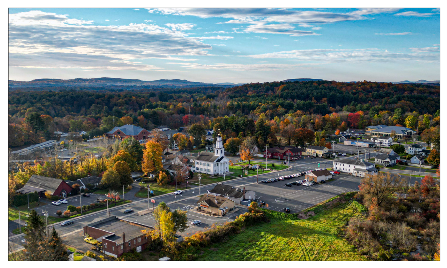
Sunset Over Southwick Center