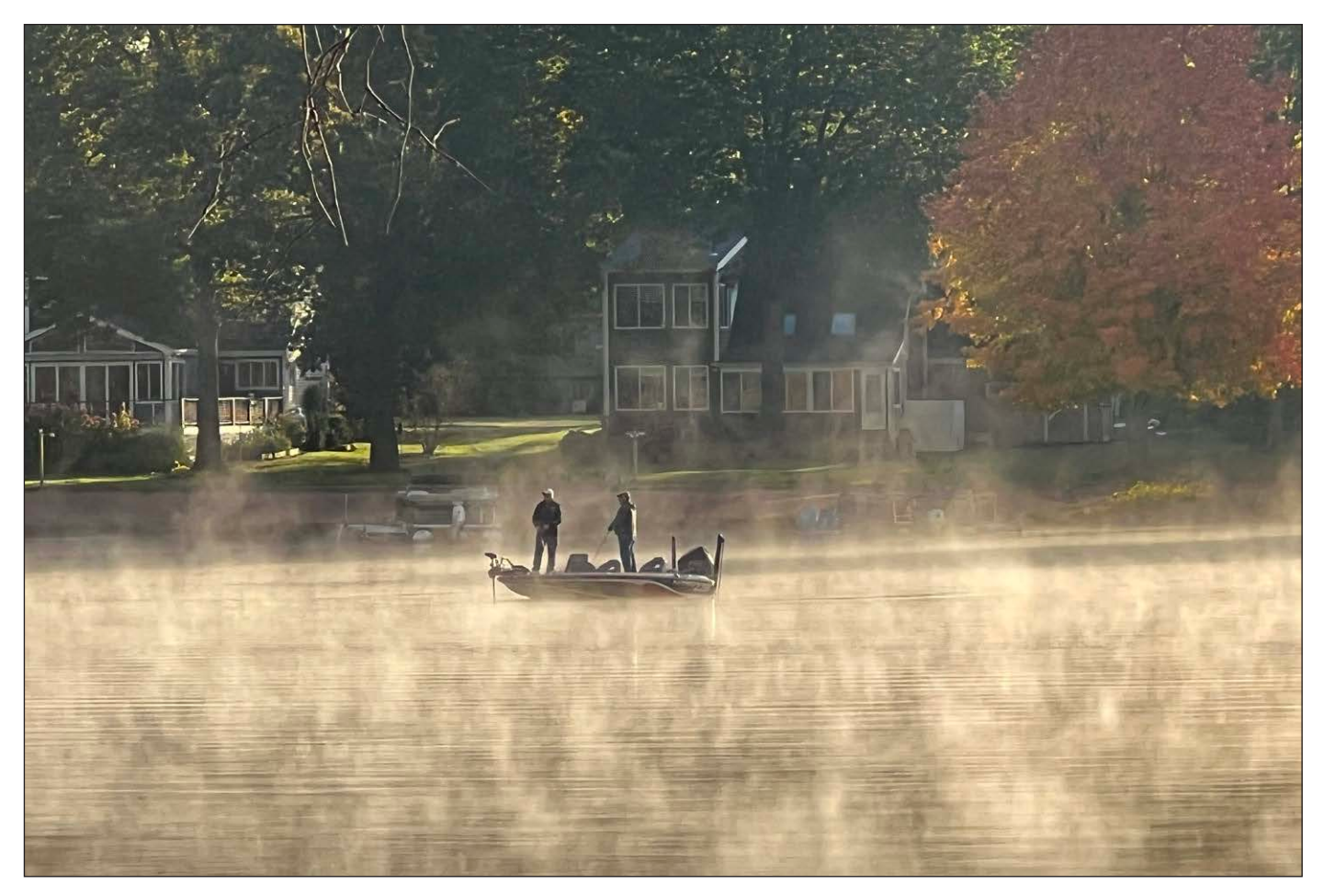
Morning Fishing on South Pond